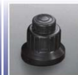
Sure-Lite™ Electronic Ignition System