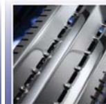
Stainless Steel Flav-R-Wave™ Cooking System