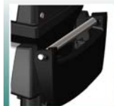
Durable Drop Down Side Shelves